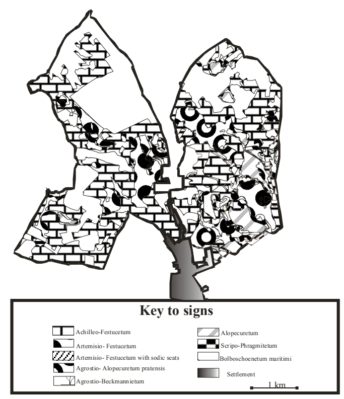
Fig. 2 The vegetation map of the study area

The ecotope-forming value, which expresses the productivity of the landscape, is determinated by the potentials of landscape. But the conditions of landscape do not form ecotope by themselves. So the ecotope- forming value comes into being in the ecotope, which is determinated in space, through the effect system of biotic and abiotic components of landscape. The ecotope is able to regenerate and maintain itself till a certain level. The ecotopes constitute biotopes for the life assemblage of animals and plants (biocoenosis is formed by the species of animal and plants living together in symbiosis) ( Bárány-Kevei , 1997).